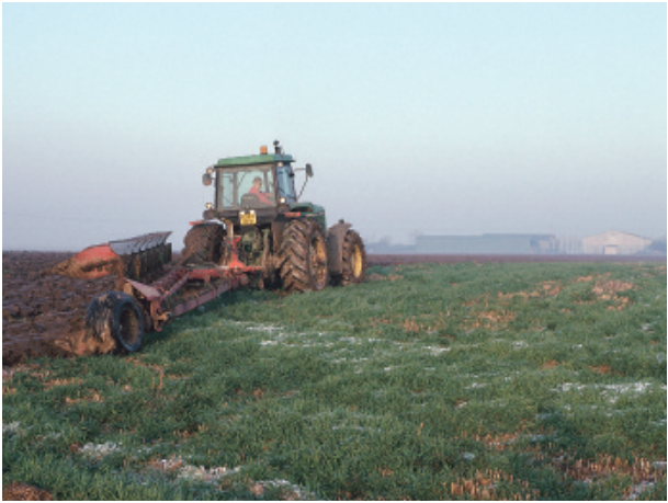
Winter ploughing – Ploughing heavy land in the northern part of the county on a cold January day, with frost still on the ground.