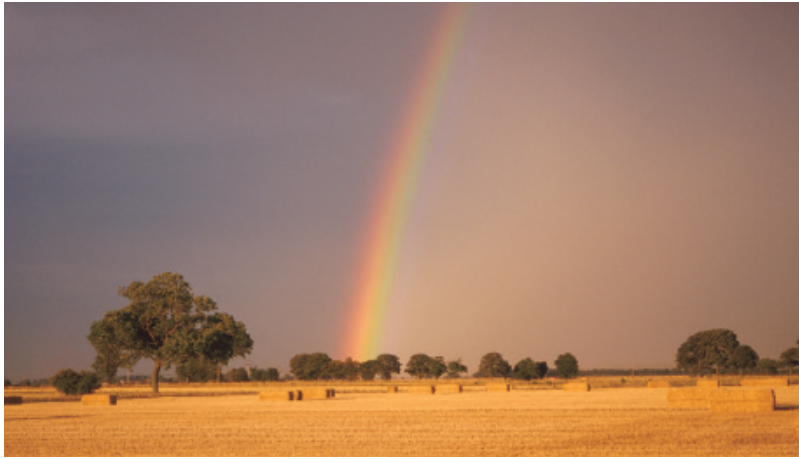
Above: Rainbow over cornfield – A summer storm passes over a cornfield near Crowle.